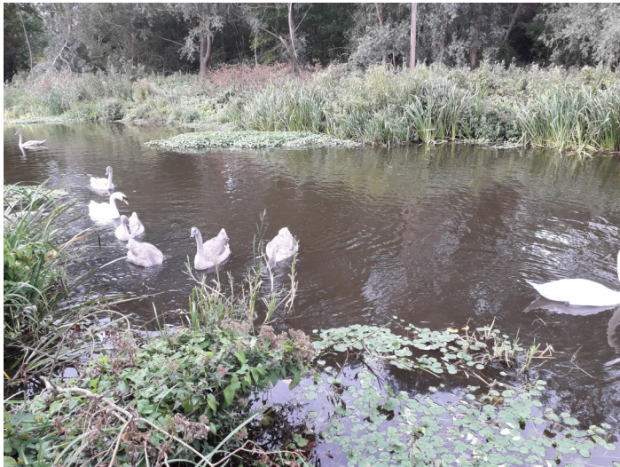
Swans near Beeleigh Falls