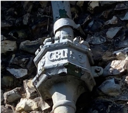
One of the downpipes dedicated to Revd C B Leigh in 1853

He also instructed that red brick walls be built around the Church and encouraged parishioners to build them along the streets to keep farm animals from entering their front gardens. At this time there were two farms in the middle of the village which both had animals that would be driven along the main streets to the fields. A possibly unique feature of the village, as they are not seen at other locations locally or elsewhere.