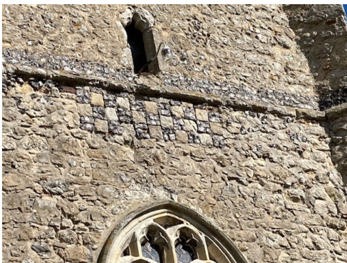
Decoration on the Church tower

One artistic touch to the front of the tower is a chequered pattern and a band of what looks like flints. Someone obviously took a lot of pride in their work and the church to spend time sorting out the right building materials to use.