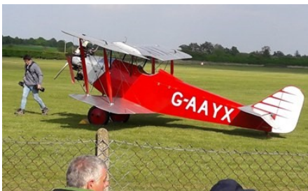
Aviation Group trip to Shuttleworth in 2017

Have a look on the website www.maldonu3a.co.uk/jigsaws/jigsaws.php and remember you can select the number of pieces according to your expertise.