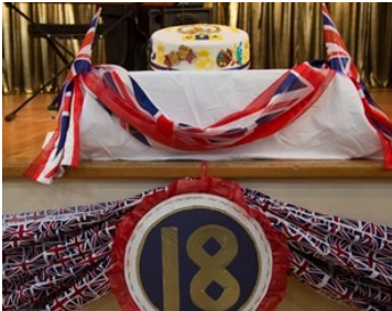
Maldon u3a 18th birthday 2016

By popular demand we have added three more puzzles.