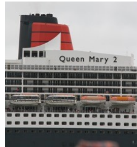
Maritime Group trip to Liverpool 2015