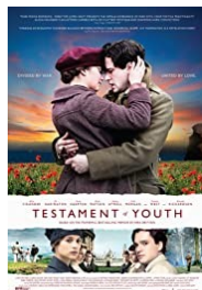
"Testament of Youth" , a 2014 film based on the First World War memoir written by Vera Brittain.

He also included another one called "Britt-Marie Was Here" , a Swedish film comedy drama, but with subtitles.