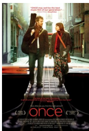
"Once" – a 2007 Irish romantic musical drama