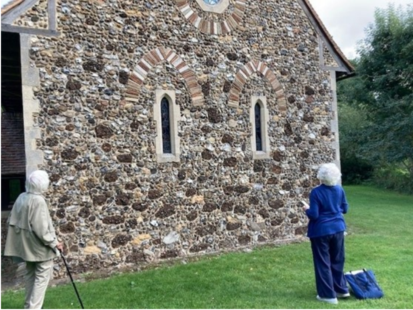
North Wall of the Church – the dark brown patches are Ferricrete