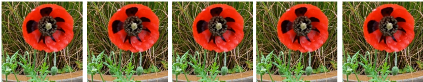
Poppies at Hyde Hall and in the garden - Liz Samson