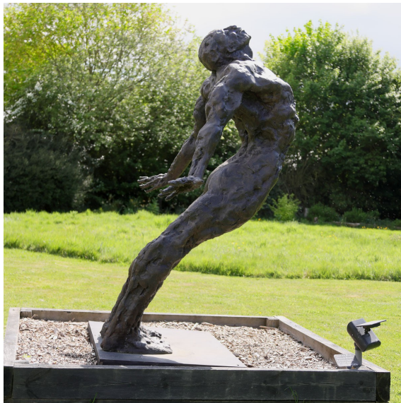
Second Breath by Maurice Blik

Art Appreciation Visit to the Sculpt Gallery