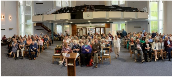
The Sanctuary, Christ Church