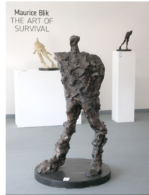
The Art of Survival

Nine of us arrived at the Sculpt Gallery on a sunny afternoon. Few of us had realised, prior to this visit, that an internationally acclaimed sculptor was living and working on our doorstep. Yet we were only at Great Braxted, just north of Maldon.