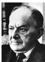
Walter de la Mare