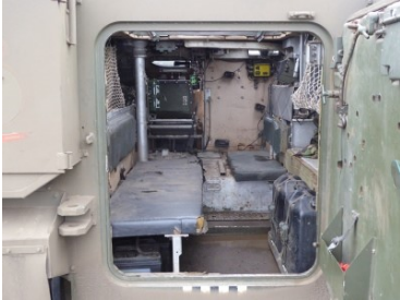
Malcolm Case Armoured Personnel Carrier

Examples of recent 'Furniture' pictures: