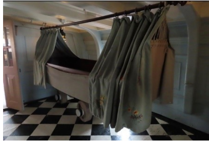
HMS Victory: Nelson's bed