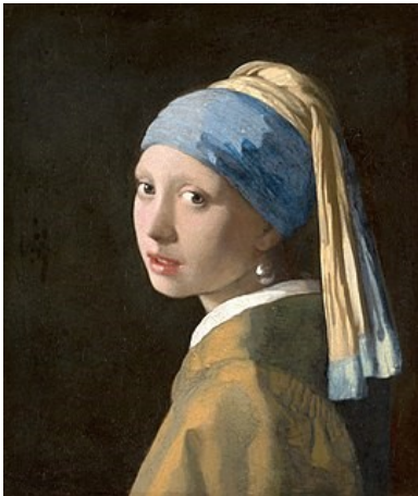
The Girl with a Pearl Earring - Vermeer

This was the largest exhibition of the artist's work ever mounted, 28 of his approximately 35 known and recognised paintings. The first and probably the last time ever for so many of his paintings to be in the same place at the same time.