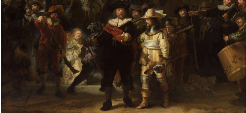
The Nightwatch - Rembrandt

An added bonus was seeing Rembrandt's magnificent 'Night Watch' in an adjoining gallery.