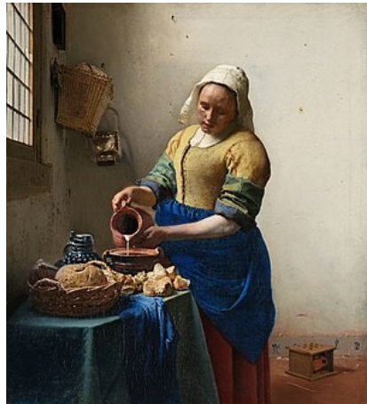
The Milkmaid - Vermeer