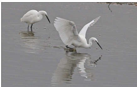
Little egrets fishing