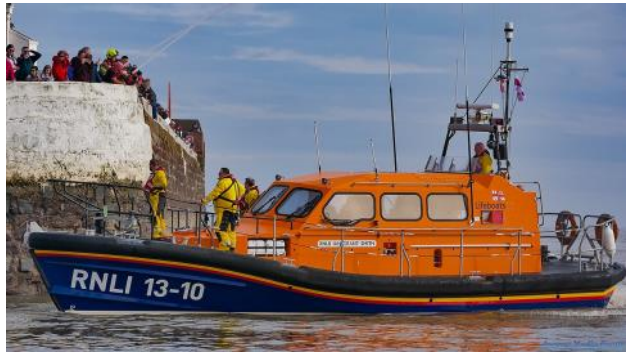
Shannon class lifeboat which can travel at 25 knots

The latest lifeboat is the Shannon Class, currently being deployed to the RNLI fleet to serve the shores of the British Isles. The Shannon class is due to replace most Mersey-class lifeboats and some Trent-class lifeboats.