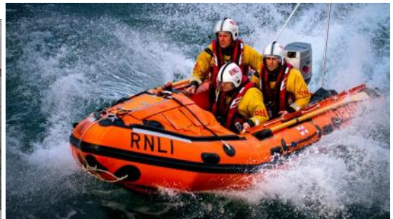
D class RIB, the workhorse of the RNLI for over 50 years