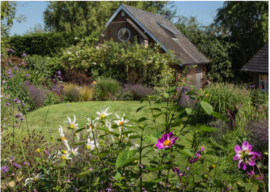
Garden Group visit to Kamala

Membership renewals are now due, see page 3 for details