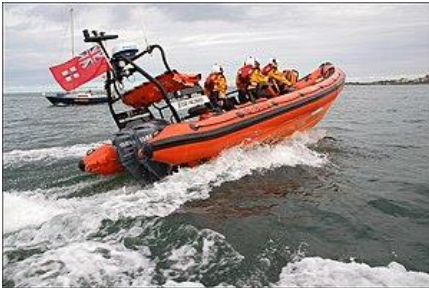
Atlantic Class RIB