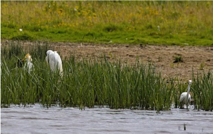
Cattle Egret, Heron and Little Egret

They are the third – and smallest – egret species after the little and great egret, to colonise southern Britain. From our vantage point in a hide, we viewed cattle and little egrets side by side. The former have yellow legs and beak, and gold crown, while little egrets have black beaks and legs with yellow feet. They arrived