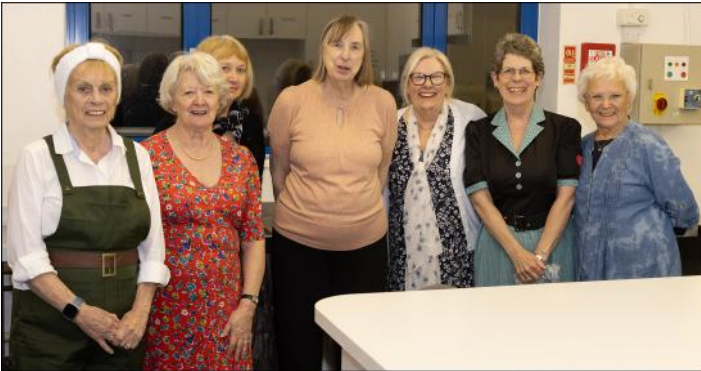
The backroom bunch

Our next event is a Beetle Drive (see page 9) on Tuesday May 27th at Plantation Hall and later in the year we will be holding a Race Night at the WMCC.