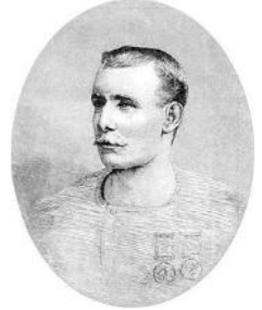
Capt. Matthew Webb

Monday 6 th April – No meeting – Bank Holiday